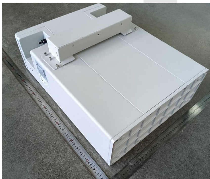
Picture 2 Back view of Rechargeable Li-ion Battery