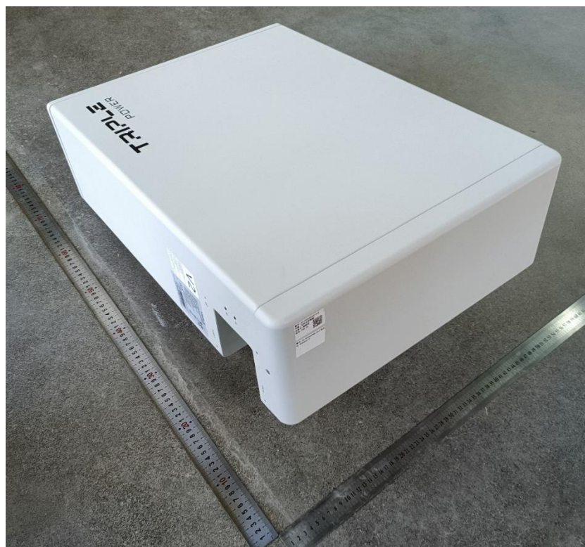
Picture 1 Side view of Rechargeable Li-ion Battery